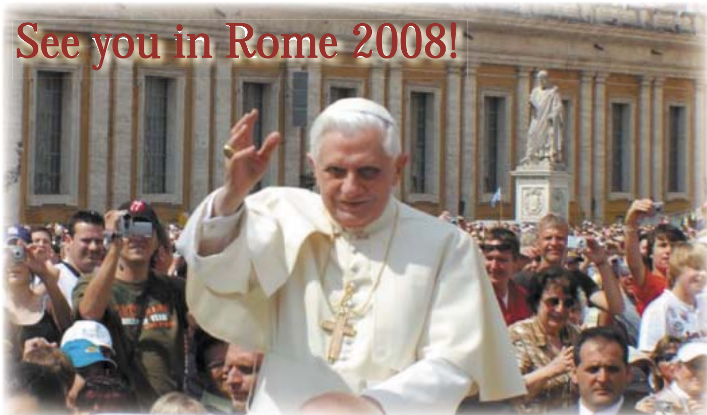
Produced by Pope Paul VI Institute Press, 2007, V.SAGE, for the American Academy of FertilityCare Professionals. On the cover, pictures from Rome: (top) St. Peter Basilica; (strip, top to bottom) statue of St. Peter in St. Peter Square, room in the Augustinian Conference Center, Swiss Guard. Inside, Speakers page: dome in St. Peter Basilica, Rome. Inside, general information page: four of eight sequential carvings around the high altar of St. Peter Basilica, Rome, of a woman in labor and her baby; (background) doctor's hands during surgery. On the back: (above) Pope Benedict XVI in St. Peter Square.

NON PROFIT ORG. U.S. POSTAGE PAID LINCOLN, NE PERMIT NO. 857