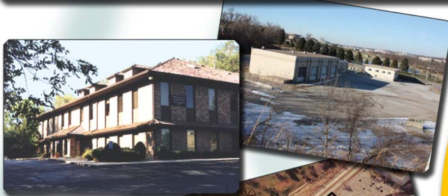
TOP: The new addition to the current building (BOTTOM LEFT) will nearly double our space and make an ideal clinic for use by patients, doctors, and staff. The 4.6 acres of land (BOTTOM RIGHT UPPER) needs to be purchased by November 21, 2011 or we will lose the opportunity to do so. BOTTOM RIGHT LOWER: An aerial view of the current site of the Pope Paul VI Institute (black) and the more than four acres immediately adjacent to it (red). The black boundary is our current facility and the red is the land we need to purchase.