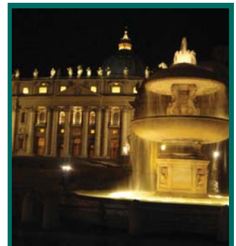
St. Peter Basilica and north fountain Rome — February 22, 2011