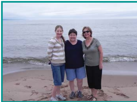
Employees from the Pope Paul VI Institute's FertilityCare™ Center of Omaha who attended the annual meeting in Duluth, Minnesota, July 2011.