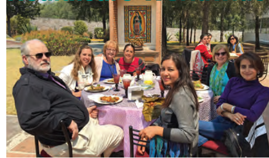
Above: Faculty and Students enjoying lunch outdoors at the Casa Lago Conference Center during the Institute’s March EP I.