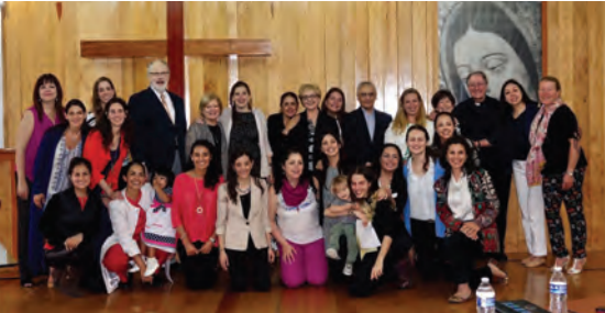
Above: Students and faculty at the 2017 EPII Class in Mexico City

Our Mexico February 2017 EPI was captured on video. Watch this amazing promotional video for our upcoming Educational Programs in Mexico City.