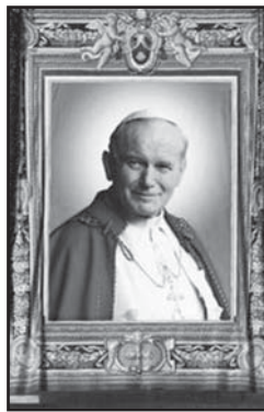
Beatification image of John Paul II